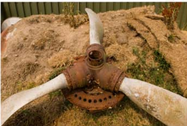
60+ year old damaged B-24 prop