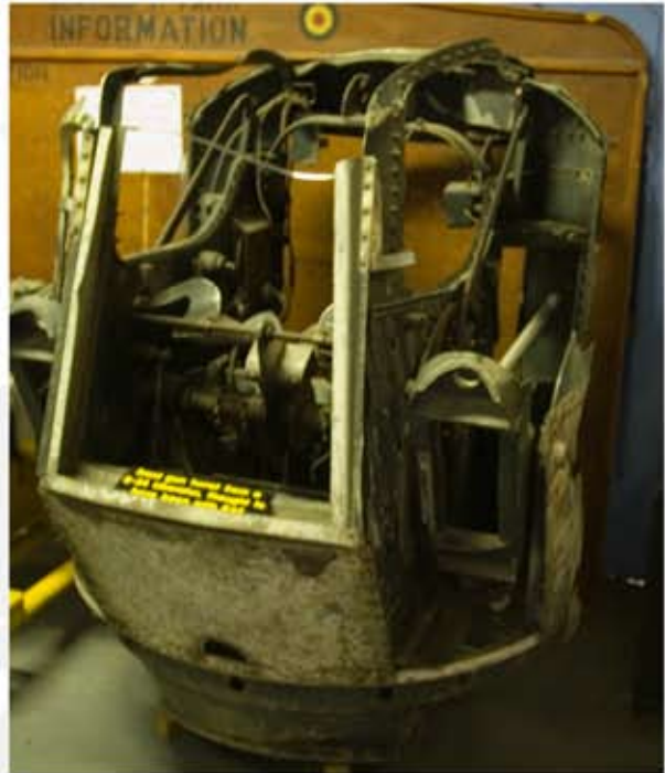
B-24 tail turret damage from a flak hit