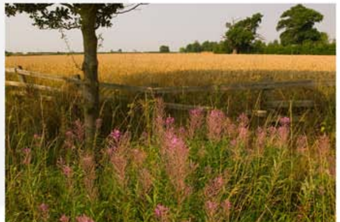
Field of Barley