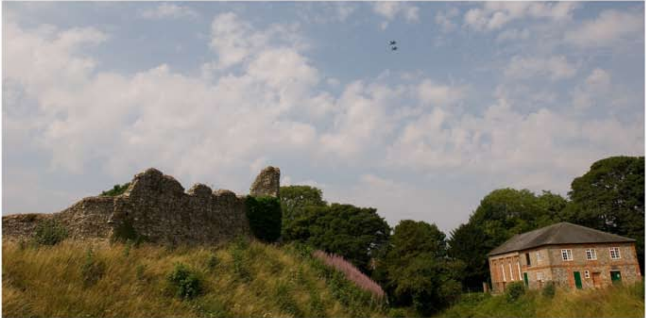
10th Century Castle Acre + 21st Century RAF Fighters