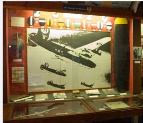
2nd Air Division Display