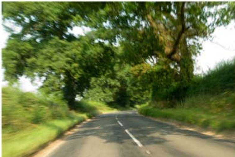
Driving on left